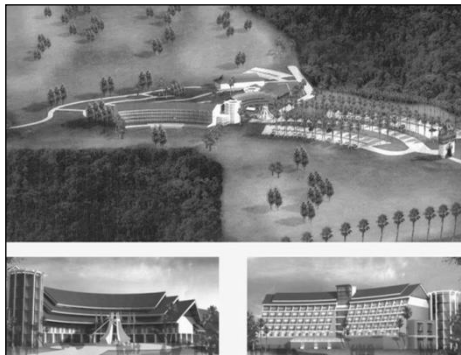
Figure 2 Savan Vegas